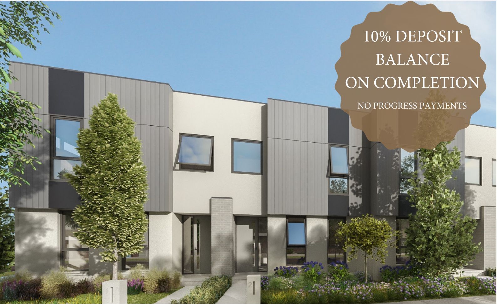
THE CAPRI MK2- LOTS 1206

10% DEPOSIT BALANCE ON COMPLETION NO PROGRESS PAYMENTS